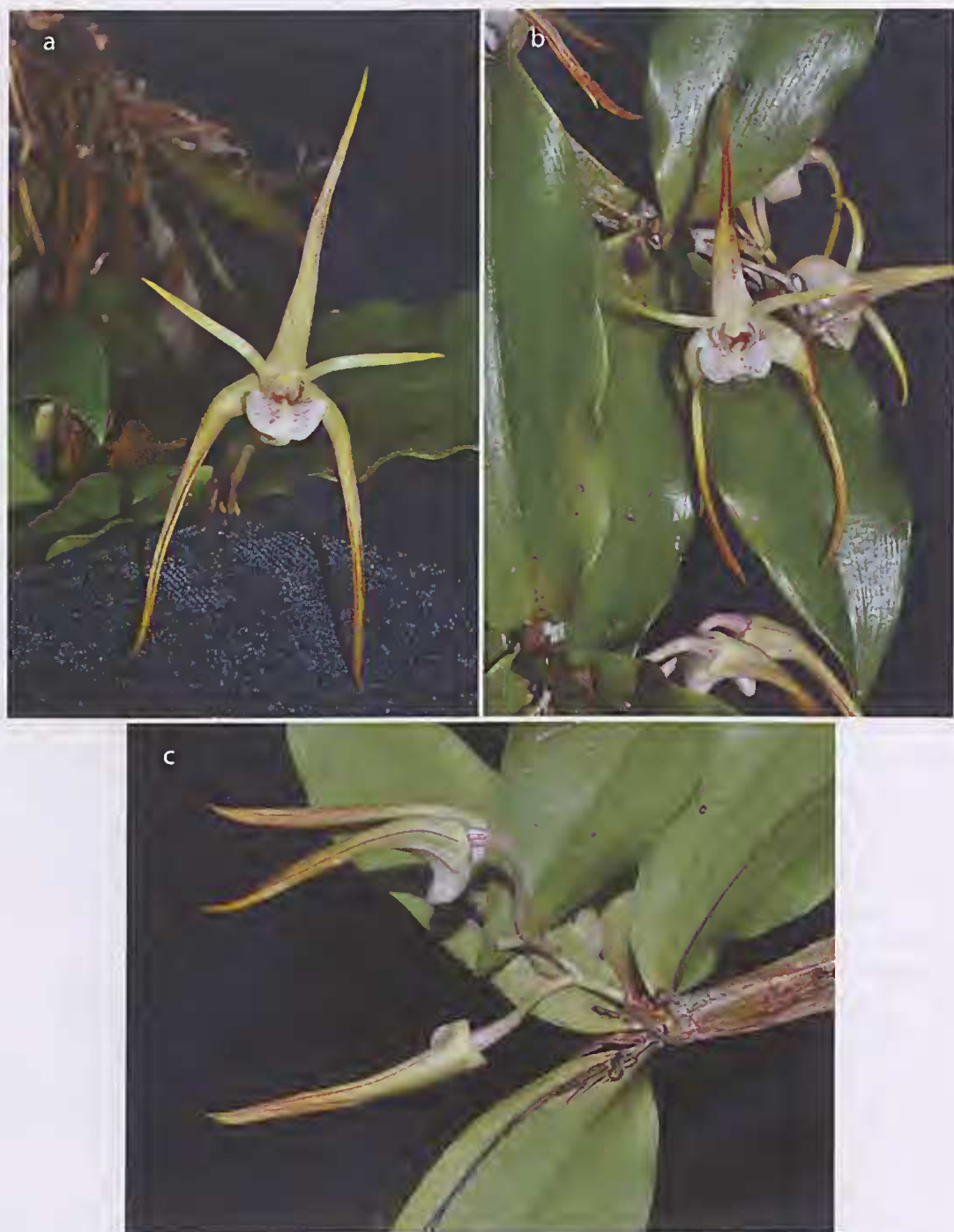
Figure 4. Photograph 1. D. tetragonum subspecies cataractarum . a. flower; b. another floral form; c. advanced buds showing slight distal twisting.